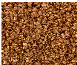
Case size - 5 kg