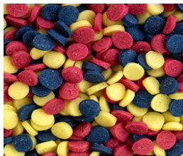
Diameter:4.5mm Case size - 5 kg