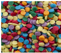
Diameter:3mm Case size - 5 kg