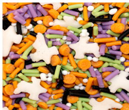
Case size - 5 kg

Pantone: Black-Black, Orange-142u, Purple-2080u, Spring Green-2300u, White-No Pantone