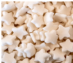
Diameter:7mm Case size - 5 kg