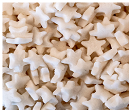
Diameter:5mm Case size - 5 kg